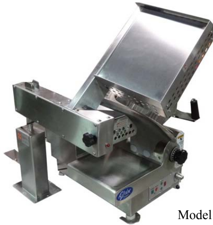
Model BW4B-1 (Slicer not included)

The Marshall Model BW4B-1 Slicer Warmer features patented ThermoGlo™ heating technology. Heat radiates from every square inch of the upper and lower flat plate surfaces maintaining uniform holding temperature and improved moisture retention for up to 45 minutes. The upper heat plate centers over the meat while the lower plate provides heat to the sliced meat as it falls onto the slicer landing area.